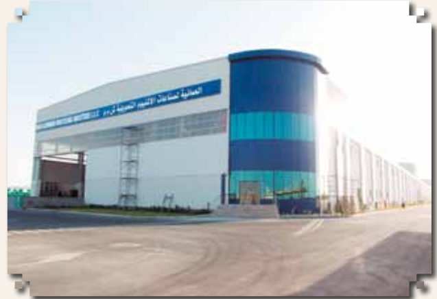
Plant from front view

A JV between Oman Cables & Takamul Investment Co