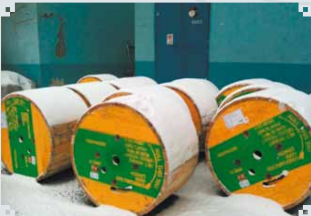
From hottest place to coldest place, Turkey