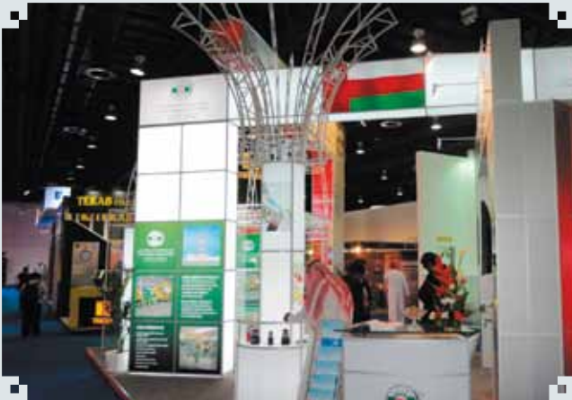
MEE Exhibition held in Dubai February 2011