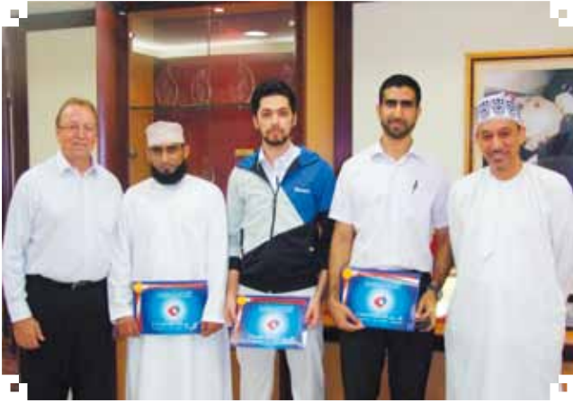
The Oman Chamber of Commerce and Industry recently held a Seminar on Leadership Skills and Leaders Building.