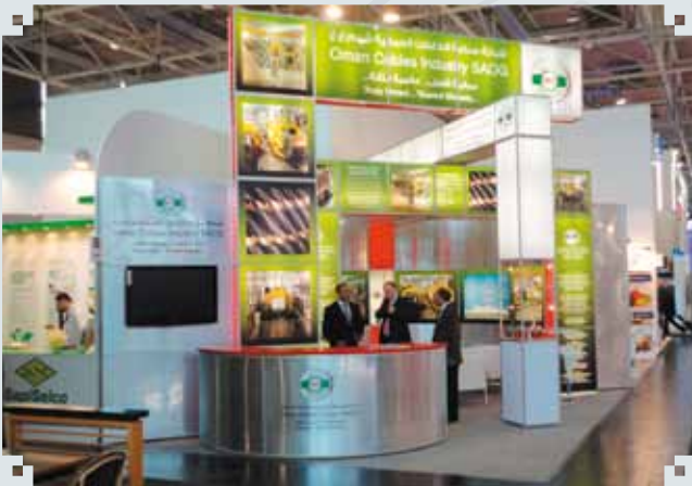
Hanover Messe – Germany, April 2011