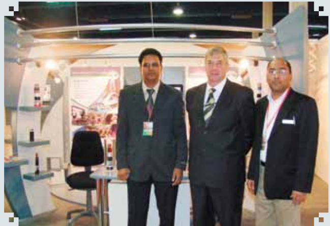
En Jazat Exhibition, Oman Exhibition Centre, Jan 2011