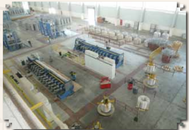
Top view – inside the plant