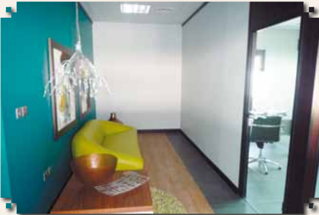
A Glimpse of a modern office