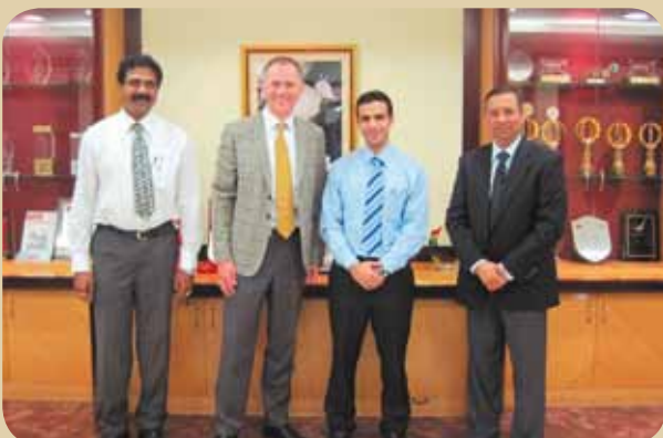
Visitors from Borealis, Singapore February 2011

Visitors from Samsung Engineering visited our factory for vendor registration, factory evaluation and factory capabilities