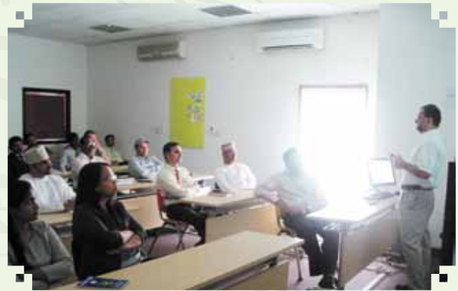
Disaster Awareness Plan Seminar

“We at OCI are proud to have such a cost-effective, fully