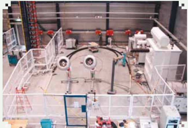
Oman Cables product samples undergoing breakdown testing in the KEMA High Voltage Test Laboratory in Arnhem, The Netherlands